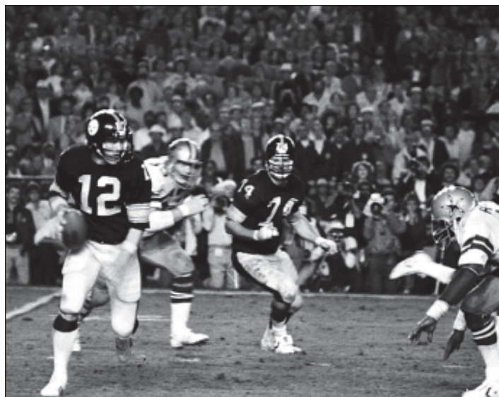
Steeler's quarterback Terry Bradshaw threw for 318 yards and four touchdowns in the 35-31 victory over Dallas in Super Bowl XIII.

RECEIVING: Pit. - Swann 7-154, 1 TD; Stallworth 3-115, 2 TDs; Grossman 3-29; Harris 1-22; Bleier 1-7, 1 TD; Bell 2-21. Dal. - Dorsett 5-44; D. Pearson 4-73; Hill 2-49, 1 TD; Johnson 2-30, 1 TD; Dupree 2-17, 1 TD; P. Pearson 2-15.