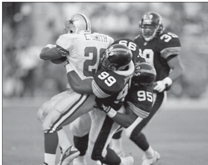
Pittsburgh's defense limited Dallas to just 56 rushing yards in their Super Bowl XXX matchup.

RECEIVING: Dal. — Irvin 5-76; Novacek 5-50; Williams 2-29; Sanders 1-47; Johnston 1-4; Smith 1-3. Pit. — Hastings 10-98; Mills 8-78; Thigpen 3-19, 1 TD; Morris 3-18; Holliday 2-19; Williams 2-7.