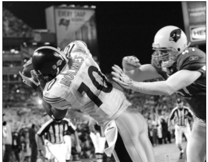
WR Santonio Holmes catches the game-winning six-yard touchdown pass from QB Ben Roethlisberger to seal the Steelers' victory in Super Bowl XLIII.

RECEIVING: Pit. — Holmes 9-131, 1 TD; Miller 5-57; Ward 2-43; Washington 1-11; Davis 1-6; Spaeth 1-6; Moore 1-4; Parker 1-(-2). Ari. — Boldin 8-84; Fitzgerald 7-127, 2 TDs; Breaston 6-71; James 4-28; Arrington 2-35; Hightower 2-13; Urban 1-18; Patrick 1-1, 1 TD.