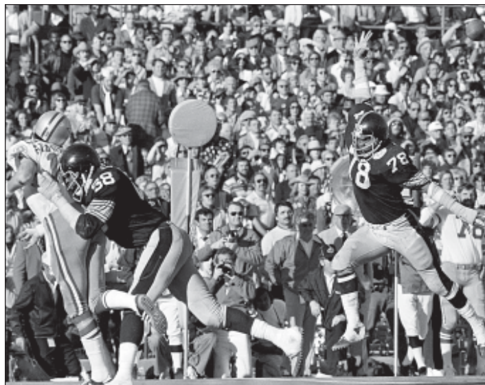
Pittsburgh's "Steel Curtain" defense forced Cowboys' quarterback Roger Staubach into throwing three interceptions in the Steelers' Super Bowl X victory.