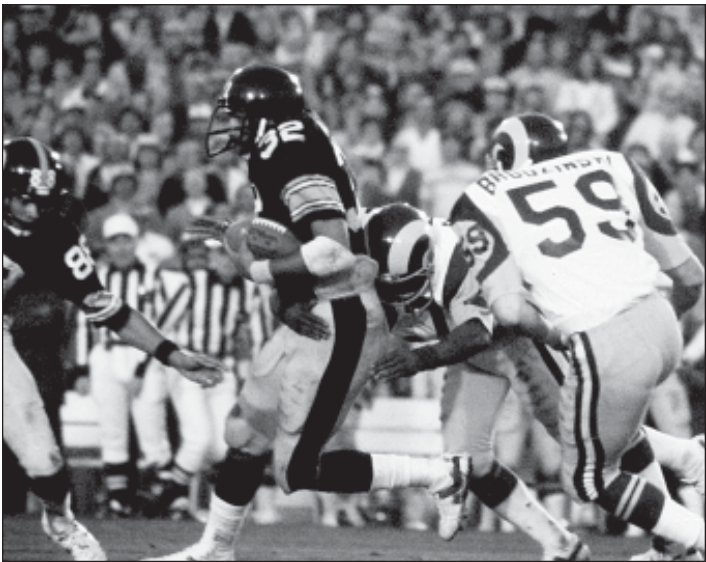
Steelers' running back Franco Harris ran for two touchdowns, including the game's final score, as Pittsburgh recorded a 31-19 win over the Los Angeles Rams in Super Bowl XIV.

RECEIVING: L.A. — Waddy 3-75; Bryant 3-21; Tyler 3-20; Dennard 2-32; Nelson 2-20; Hill 1-28; Smith 1-24, 1 TD; McCutcheon 1-16. Pit. — Swann 5-79, 1 TD; Stallworth 3-121, 1 TD; Harris 3-66; Cunningham 2-21; Thornton 1-22.